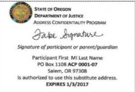
ACP Authorization Card (front)

Under Oregon Department of Justice’s Address Confidential Program (ACP), DMV will allow eligible participants of the ACP to use the ACP substitute address in lieu of an actual residence on DMV records and a license, permit or identification card. (See ORS 192.820 - 192.868 )