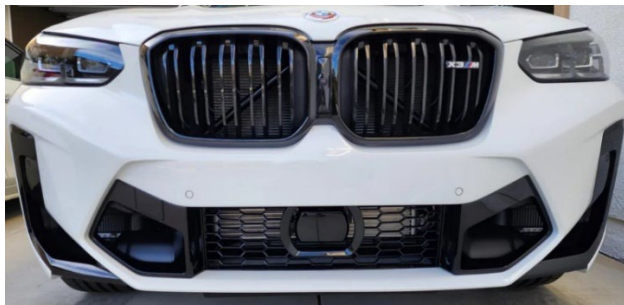
Example of "failure to display registration plates"

A license plate serves as an identifier, and having two is an added benefit. Front plates can help accurately identify stolen cars, or vehicles involved in hit-and-runs or other crimes. Reflective front plates can significantly improve the ability to identify vehicles on the road at night, reducing the risk of crashes. Front plates make it easier for law enforcement and government agencies to identify vehicles that are speeding and to verify registration stickers. They can also be helpful when identifying a ride share as it pulls up to the curb or finding your car in a parking lot full of silver cars.