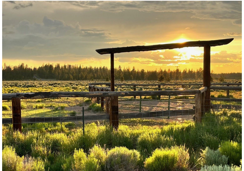
Chase King, Region 5 Tech Center Ontario